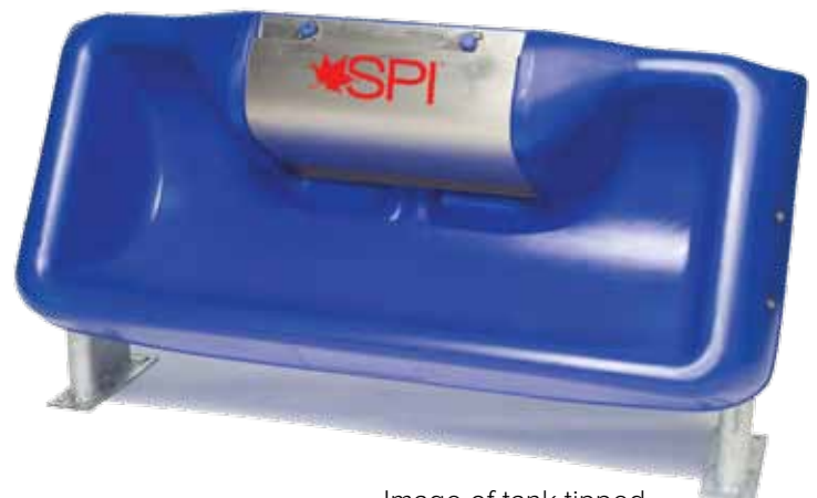
Image of tank tipped.