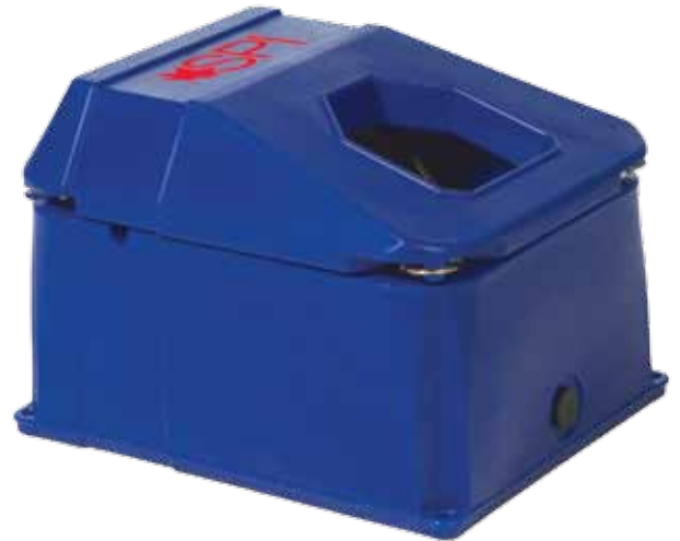
Model No. 352NG