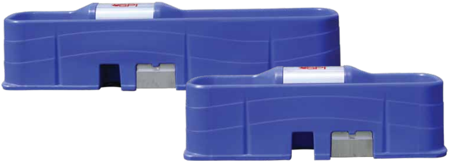
Model No. 10XL