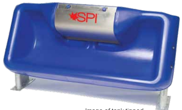
Image of tank tipped.