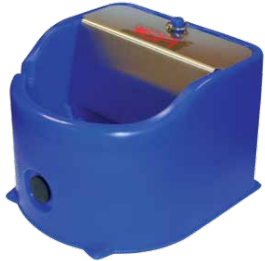
Model No. VS20LPE