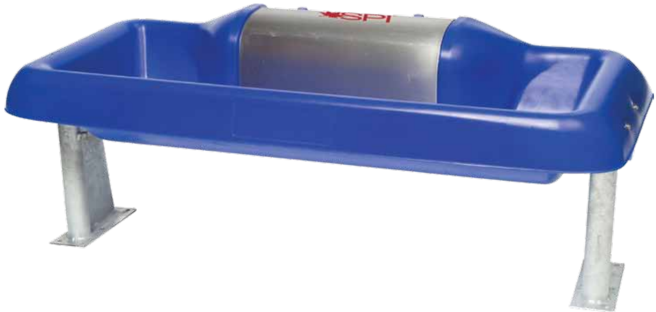
Model No. TIPTANK4,NG