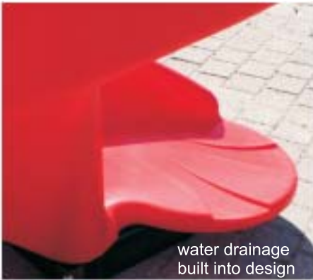
water drainage built into design