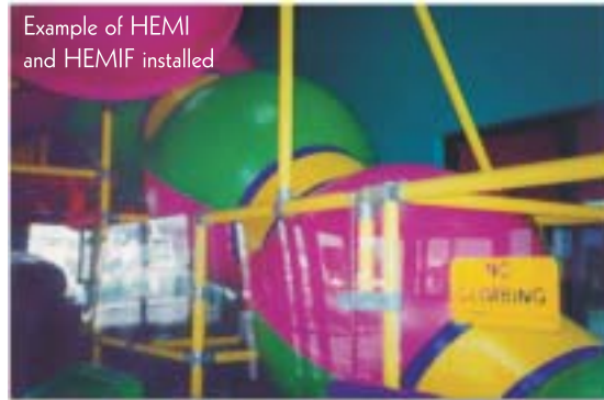
Example of HEMI and HEMIF installed