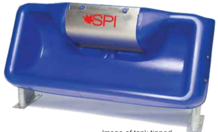
Image of tank tipped.