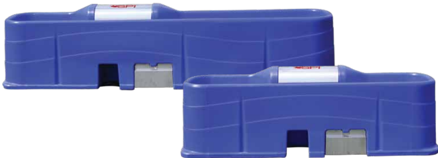
Model No. 10XL